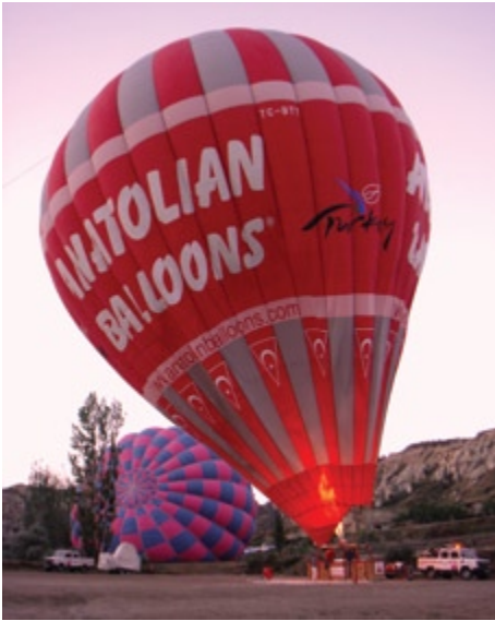
Launch of hot air balloon.

With a busy Fall season ahead of us, I hope everyone took a little time off this summer to relax at home or enjoy a vacation abroad. Personally, I had the opportunity to revel in the fascination of flight with a hot air balloon ride in the enchanting region of Cappadocia, Turkey.