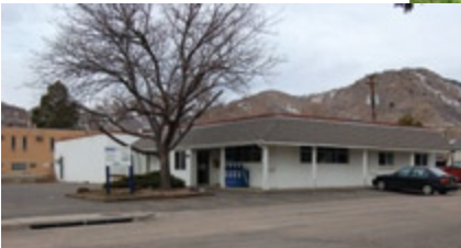
(below) Former Transcript Building and the newly renovated Annex (right).

How effective has the implementation of our HSE Plan been? Norwest has been involved in the management and execution of field programs in Alberta's oil sands sector for the past seven years. These field programs are conducted during the winter months (December - March) in the severe climate of northern Alberta. Although Norwest's work scope has expanded over the years from the provision of field geology services to include overall program management (planning, development, drilling, field construction, and operational support services), we have seen a continued improvement in both the safety and overall program performance as our HSE Plan implementation has progressed. We will provide more specifics updates in future editions of the Norwester.