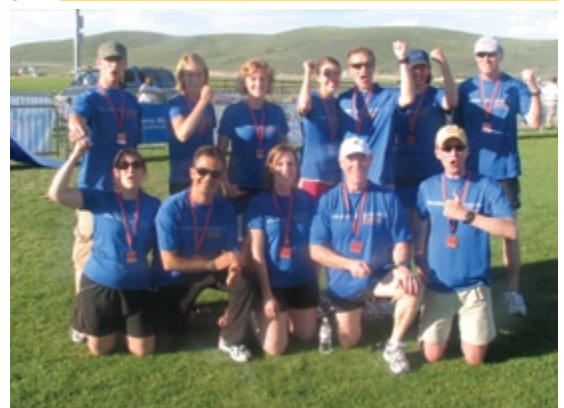
The Wasatch Relay Team