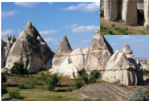
Three views of the Fairy Chimneys

The region has hosted numerous civilizations over the years and it's easy to see why. Caves and dwellings have been carved from the rock slopes