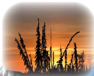
Scenes from Questville, affectionately named by the Oilsands Quest/Norwest project crews.

Oilsands Quest, supported by Norwest's geology team, launched an inaugural program to delineate a resource area which could significantly expand the