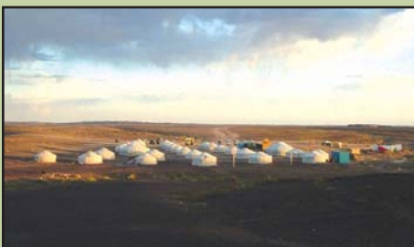
Exploration Drilling Camp, South Gobi Desert, Mongolia

Mongolia, a land-locked country known for its rich history and sweeping landscapes, is becoming an epicenter of mineral exploration activity. Few regions of the world contain the potential for both coal resource and metallic mineral development as the