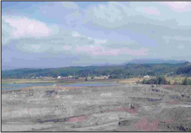
Remediation of Pit Wall Instability at Central Packwood Pit, Centralia Mine

The Norwest-Applied Hydrology merger was accomplished to form a hydrology and water resources engineering group within Norwest to help solve problems faced by the mining and energy resource industries. The combination is already exceeding expectations as hydrologists, hydrogeologists, and water engineers join geologists, mining engineers, geotechnical engineers, and petroleum engineers on a variety of projects. The projects have been quite diverse, ranging from a coalbed natural gas project in northwestern Colorado to a geotechnical stability and water management project in Indonesia. A project recently completed at the TransAlta Centralia Mine in Washington is particularly noteworthy. It required the integration of hydrology, geotechnical, and mine engineering and set a record time for completion and permit approval of the mine plan modification.