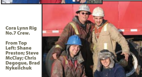
Cora Lynn Rig No.7 Crew.